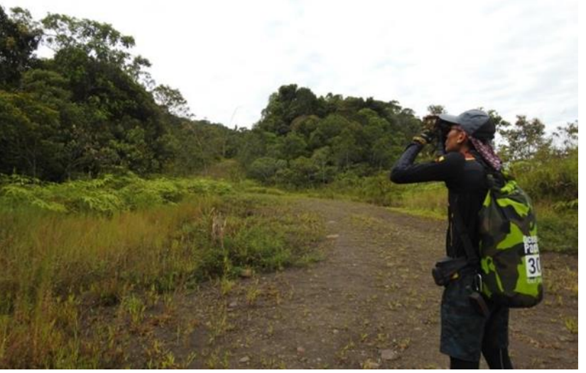
Photo 7. Conducting point counts in Trail 1