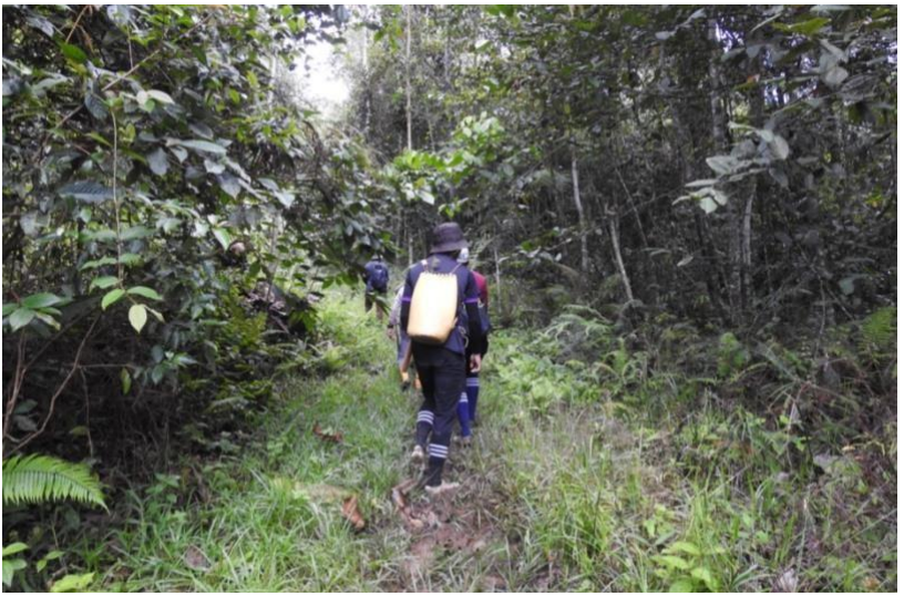
Photo 2. Walking along a trail in Paya Maga