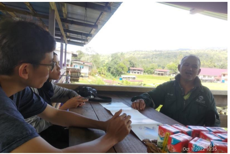
Photo 10. Community interview in Long Telingan