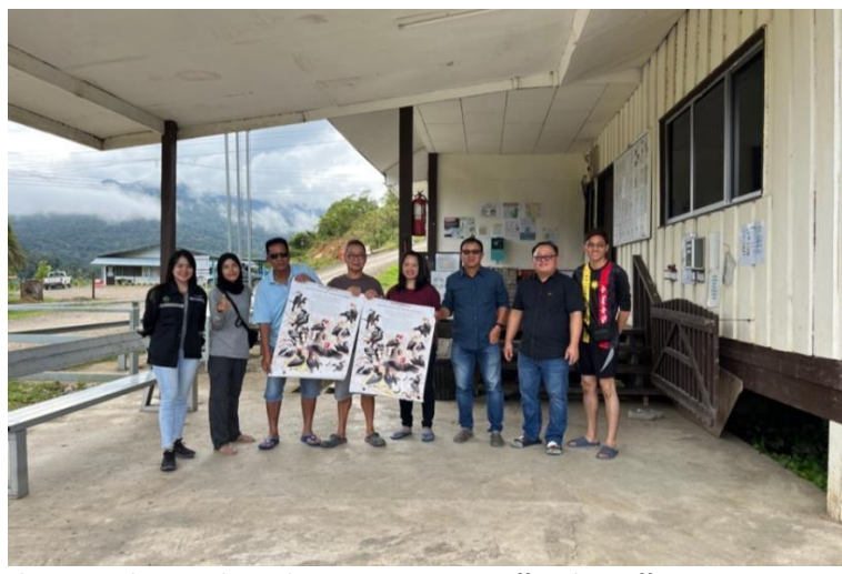
Photo 18. Photo with Samling management staff at their office