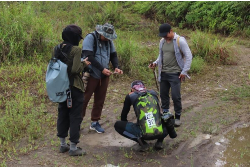
Photo 4. Team observing Sambar Deer tracks in Trail 1