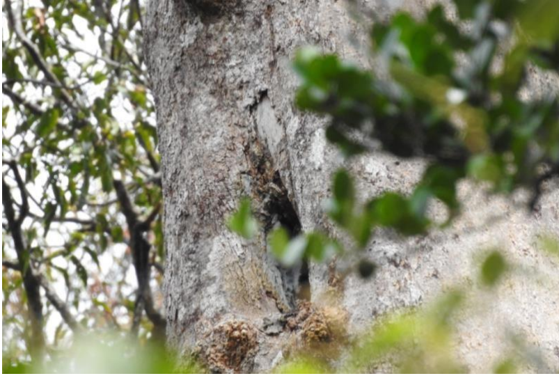
Photo 5. Potential hole observed in Trail 3 but no sighting of hornbills