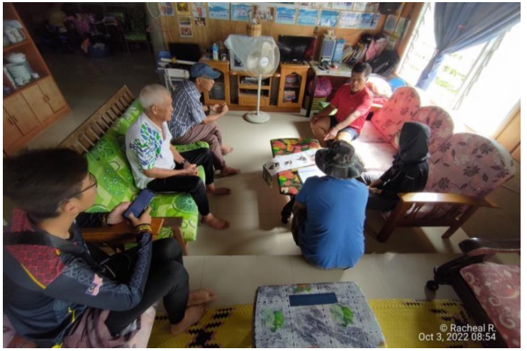
Photo 9. Interviewing the community in Ba'Kelalan