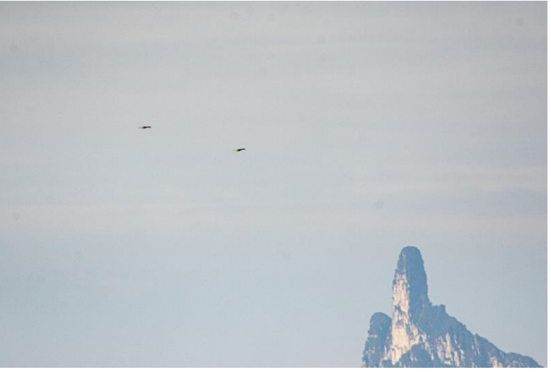
Photo 30. Rhinoceros Hornbills flying over Batu Lawi