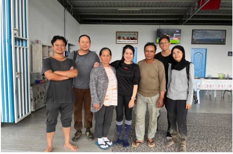
Photo 17. Group photo with the guide at Paya Maga