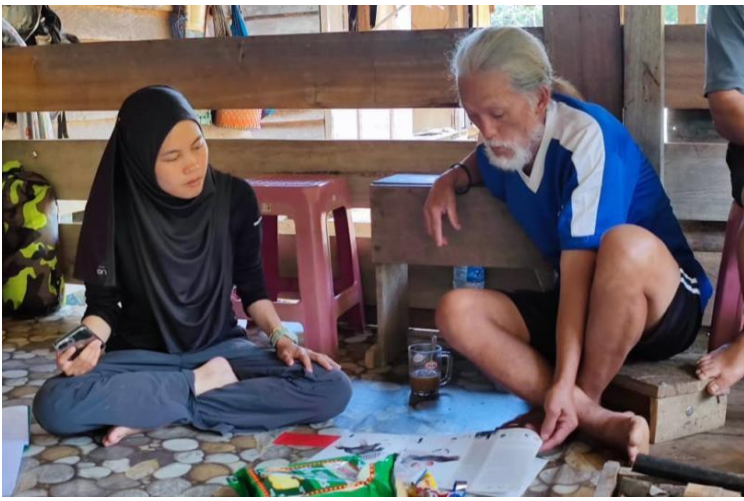
Photo 12. Interviewing locals in Demaring