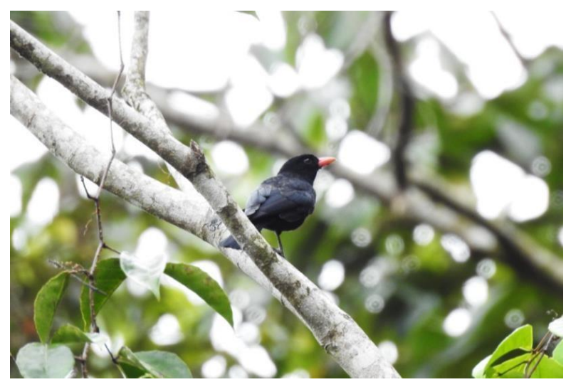
Photo 22. Black Oriole in Ravenscourt FMU