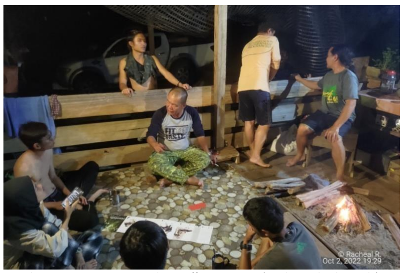
Photo 13. Interviewing Samling staff in Demaring