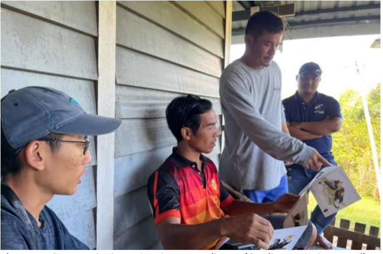
Photo 11. Community interview in Long Telingan