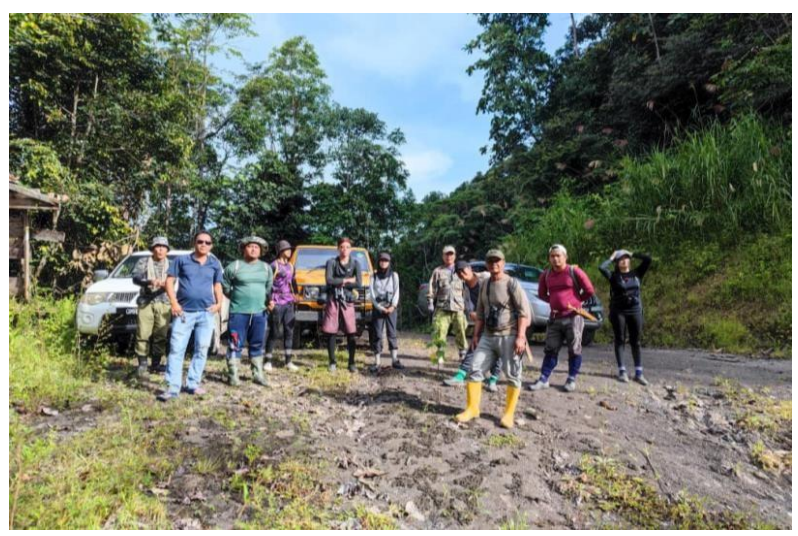
Photo 19. Team photo after surveying Paya Maga